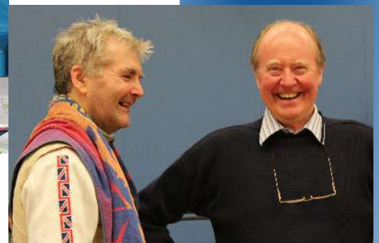
Some of the BVF committee members at the 2013 Age Groups