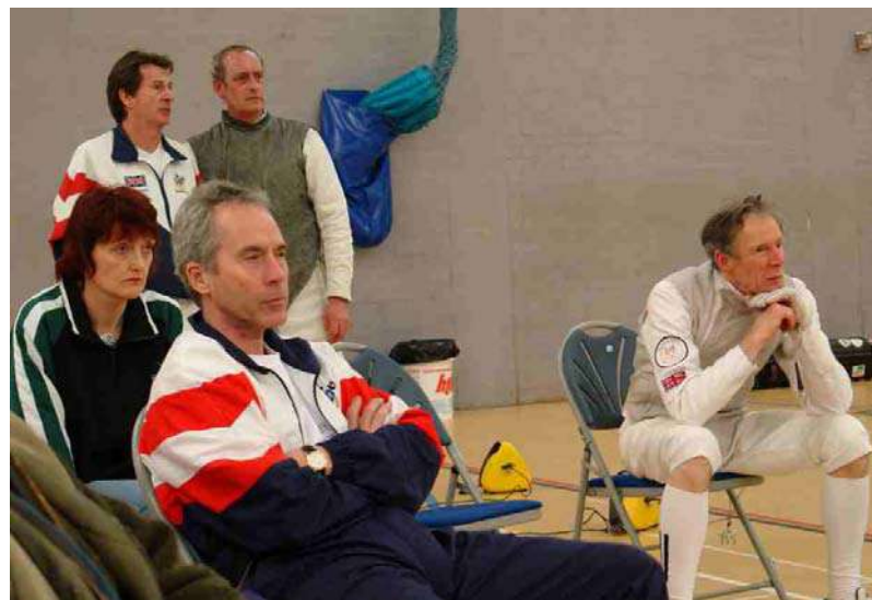
Enthralled audience, Men's Foil Final, National Championships

Discounted accommodation is available at the local Novotel. See application form for details.