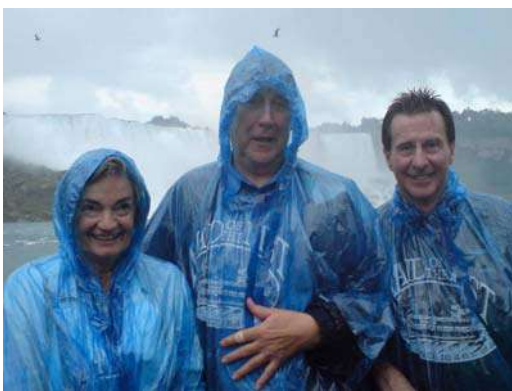
And I thought I had a bad hair day!!

CAPTION COMPETITION!!! SEND YOUR ENTRIES TO THE EDITOR (see front cover)