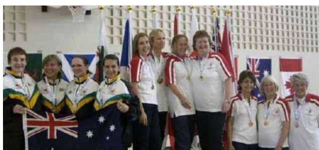
England A, Australia and England B Women's Sabre