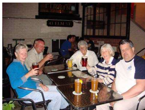
Well YOU are (and the glasses)