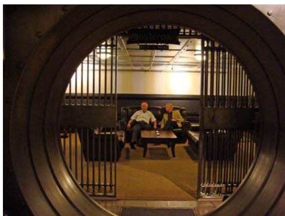
The Welcome evening in a Bank Vault! (Best place for these two...)