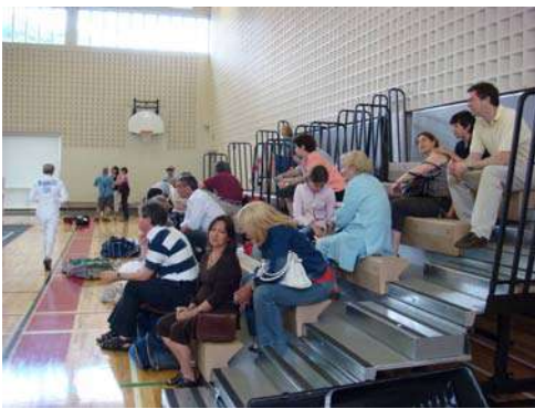
We also serve who sit and wait....