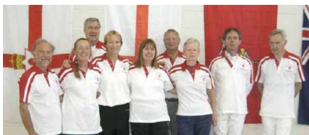
Part of the England Squad