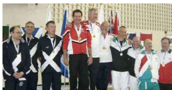
GB clean sweep at Men's Sabre