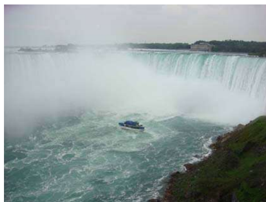
Niagara Falls and Maid of the mist