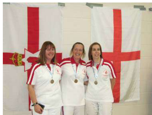
England Women's Epee A team

This edition: special thanks to all my roving photographers