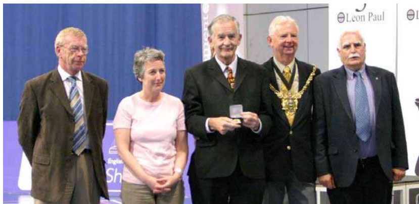
We accepted this on your behalf