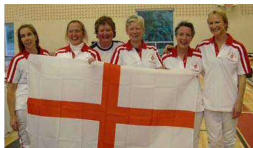
England A and B foil teams