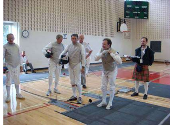
How could I resist this one?