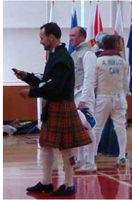
A Canadian-Scots Ref