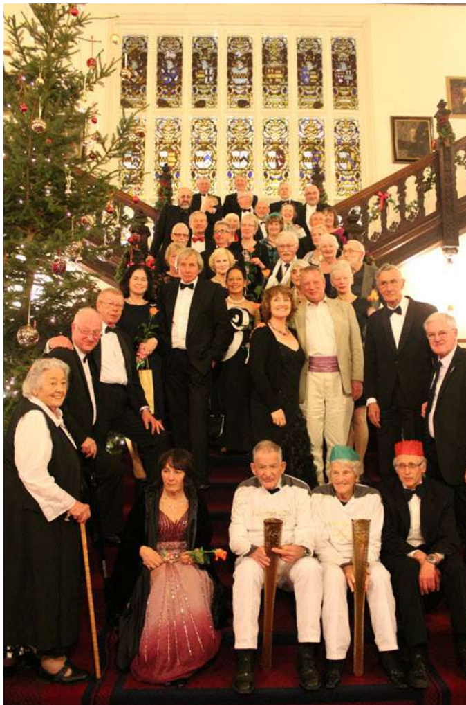
Vets and guests at Beaumanor Hall

25th Anniversary BVF v Royal Navy Competition results