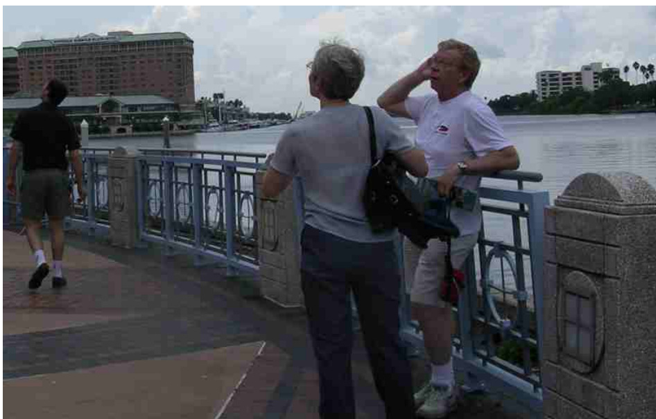
Confused looking Vets at the last Worlds in Tampa 2005

Please sell your allotment of tickets as soon as possible (get it out of the way) and return the counterfoils to Hilary Arnold with a cheque made out to NVA for the amount sold. If you want extra tickets contact Hilary Arnold: NVASecretary@veterans-fencing.co.uk or 020 8373 7953.