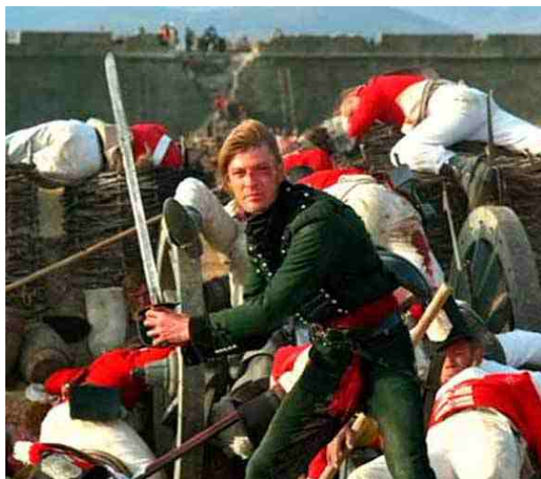
Sean Bean is Sharpe