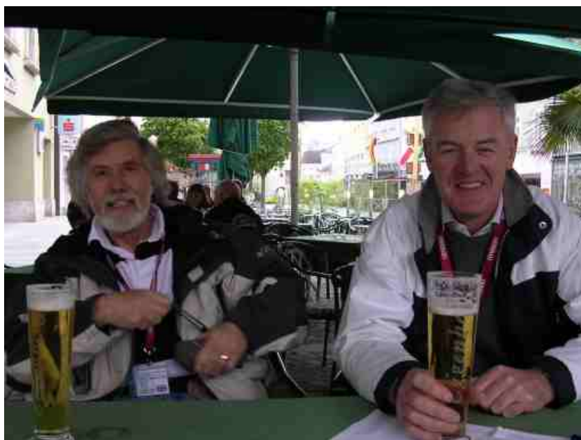
News Year's Resolutions? Gone!