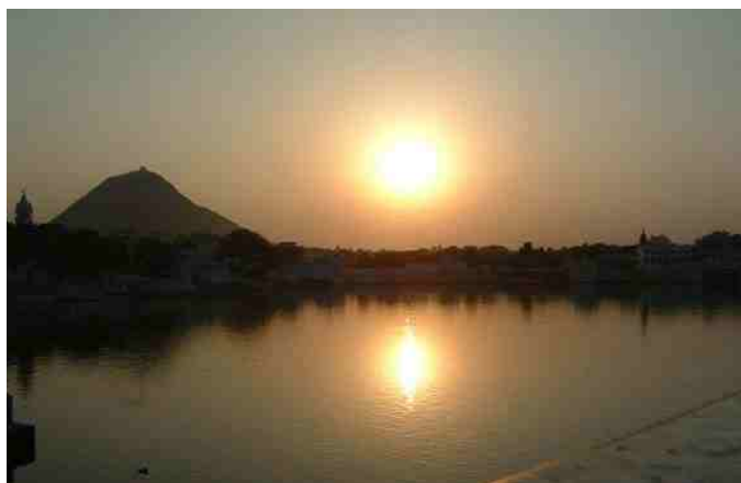
Sunset over the sacred lake at Pushka

It is impossible in such a short article to convey the beauty of such a wonderful country. It is a continent of extremes. Poverty of biblical proportions exists alongside extreme wealth.