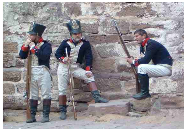
Russian Soldiers Waiting to Die

Evenings were spent having dinner under the stars, usually by the pool and the one day a week off spent sunbathing and relaxing. One such day I visited the Holy City of Pushka to witness the biggest camel and horse fair in India. A fascinating experience which I will never forget which culminated in watching the sun set over the sacred lake. For a change no gin and tonic in hand as Pushka is a sacred city and no alcohol is available