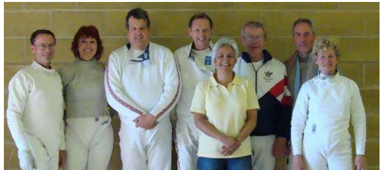
Most of the 3 teams: White Horse Team Trophy July 2007