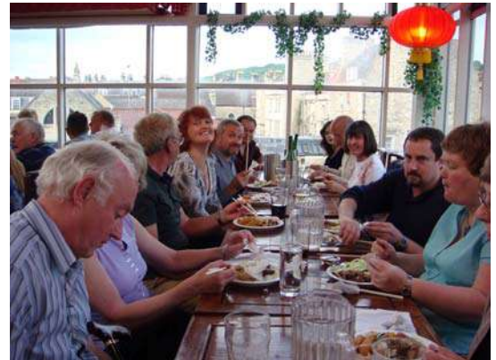
Fencers at rest!