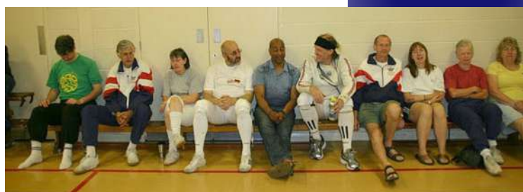
What is the collective noun for a group of Veteran fencers? Suggestions to Editor!