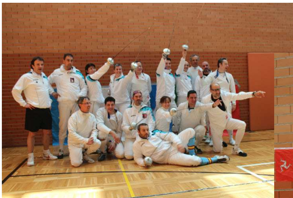
Some of the Galician team