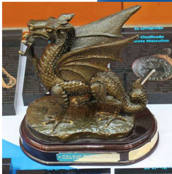
Arthur (Arturo) The Celtic Dragon (born in Wales)