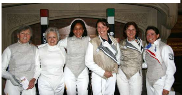
GB and German Women's Foil teams

This was a memorable weekend and the thanks of the BVF go to the many who contributed to its success.