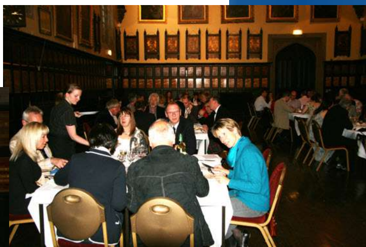
A convivial time at the Dinner