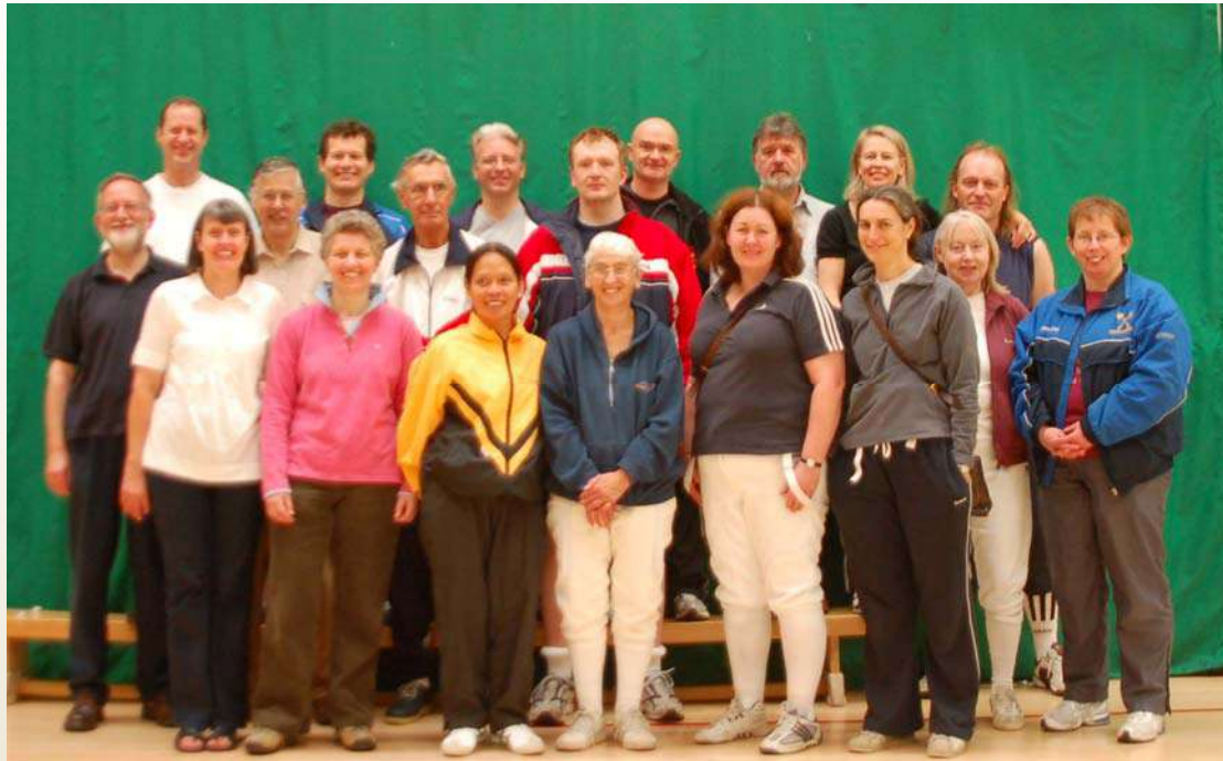
Above: The Midlands