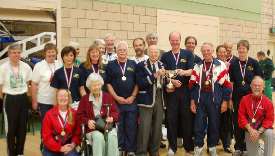
Above: the Victorious South West