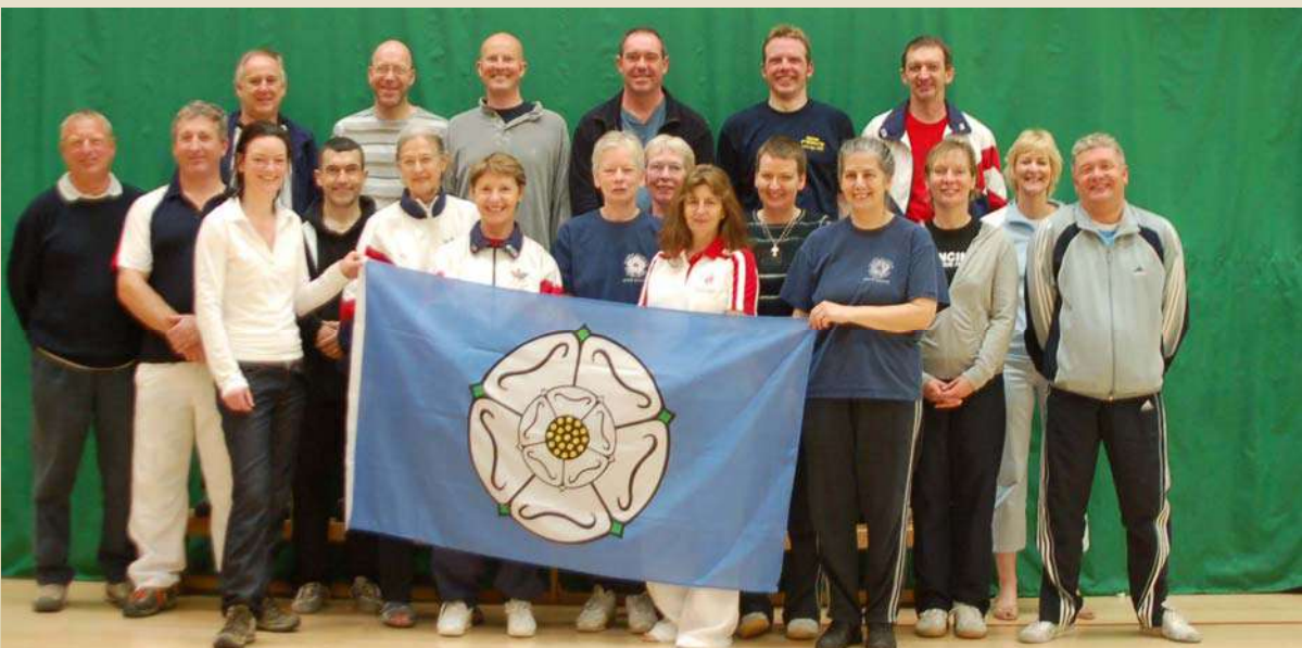
Below: Second Placed Yorkshire