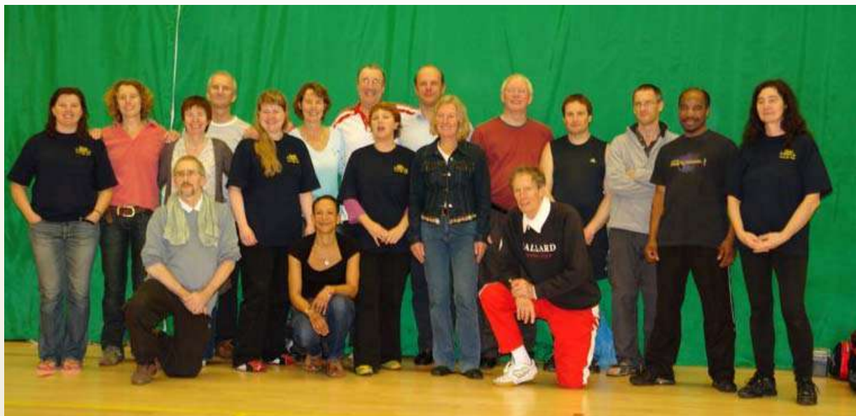
Above: South East