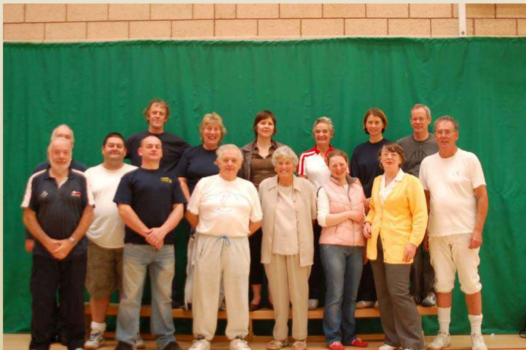
Below: Norfolk and the North East