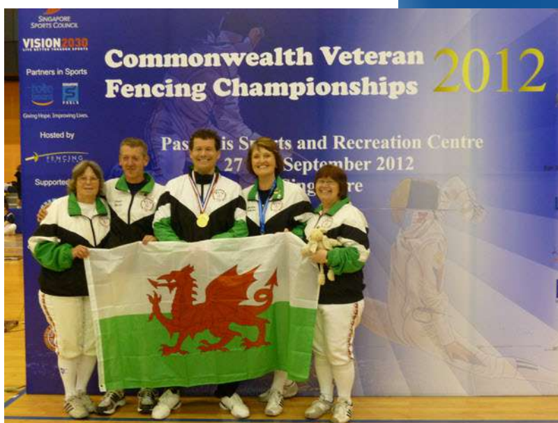
Team Wales Singapore