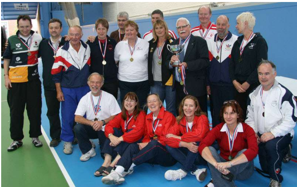
The victorious South West team