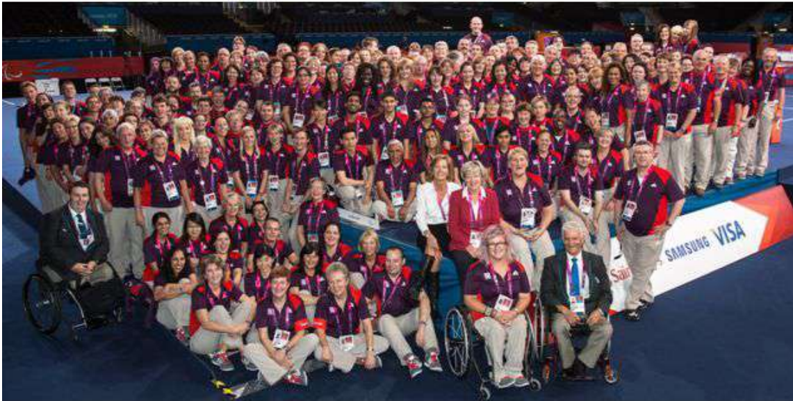
Some familiar faces to be found in this photo of the 2012 Paralympic Wheelchair Fencing team and Gamesmakers

Ev becomes an 'Olympian' Fencing in St Petersburg Training in Italy