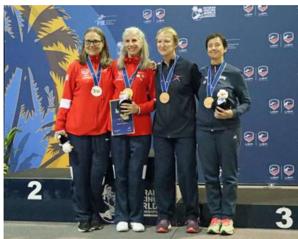
WS 60 medallists