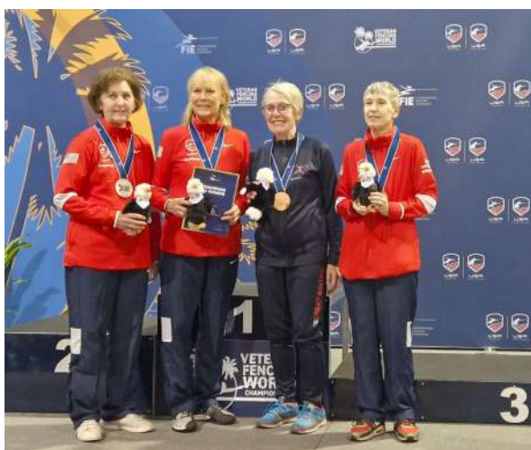
WS 70 medallists