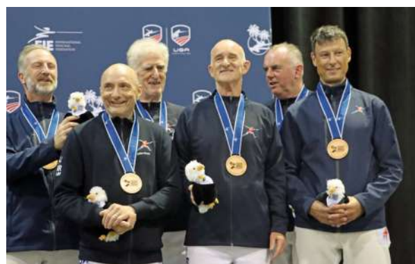
MS Team on the podium