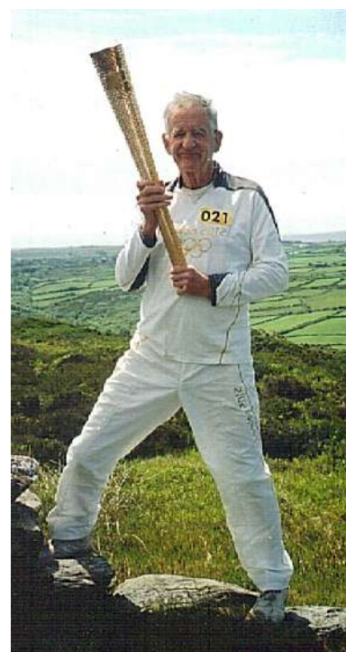
Olympic torch bearer 2012