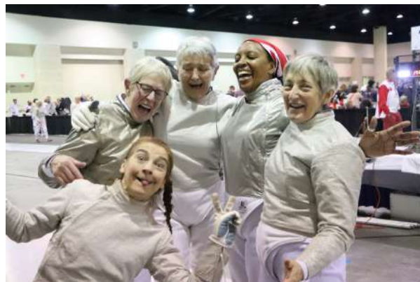
A pause in the poules with two French fencers

The team ranked 2 nd after the poules in a field of 7 teams, because of the rules could not fence a team in the first DE who they had fenced in the poules (AUS). USA ranked 1 st decided to fence in the first DE (L8) and GBR were thus given a bye into the semi-finals. A good victory of 30-23 over AUT gave them a place in the final against USA. A sterling performance against very strong opponents resulted in 22-30, with well-deserved Silver.