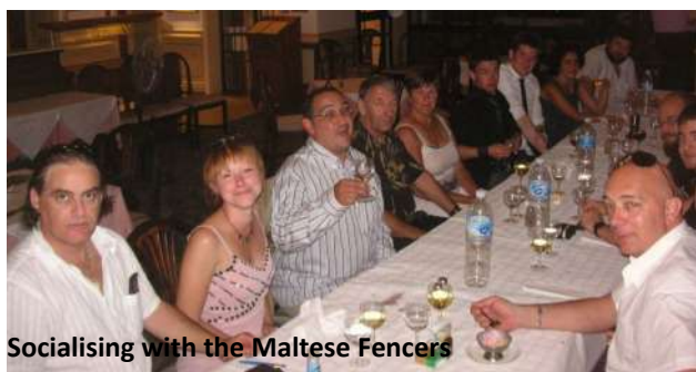
Socialising with the Maltese Fencers