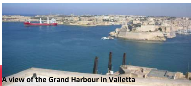
A view of the Grand Harbour in Valletta

Sponsored by Salago on behalf of St Pauls Fencing Club