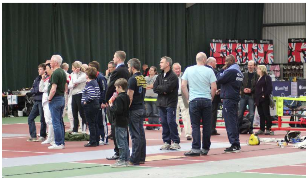
Foil day at Oxstalls Sports Park