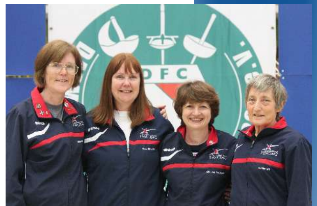
Women's Epée team: