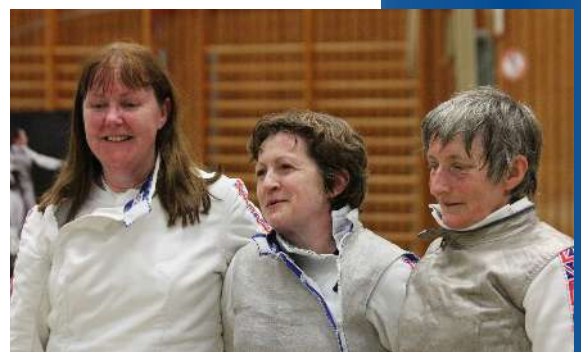
Women's Foil team: