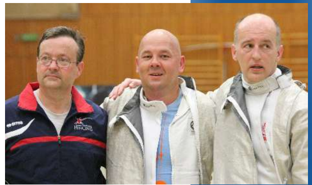
Men's Sabre team: