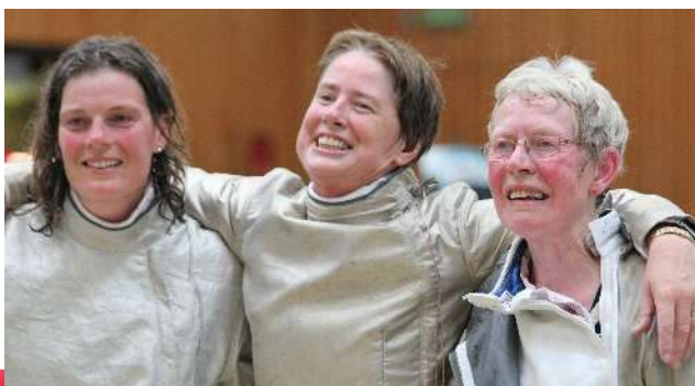
Women's Sabre team: