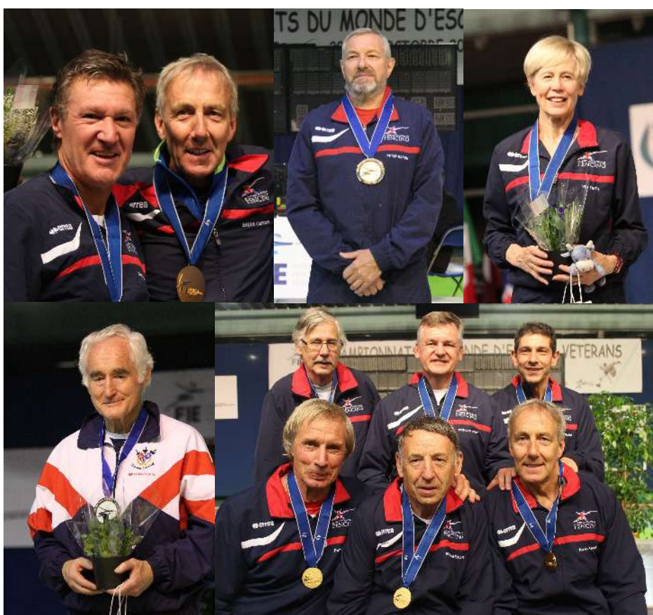
Medallists at the Veterans World Championships Limoges, France