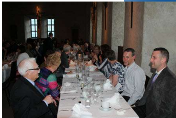
Time to relax

Saturday night was a chance for most of our fencers and officials to relax and enjoy the Gala dinner in Kalmar castle. A beautiful venue with a tasty dinner, and entertainment including outdoor fire juggling in the courtyard, followed by dancing to a live jazz band in another part of the building. However it was a fairly early night for me and those who were fencing the next day.