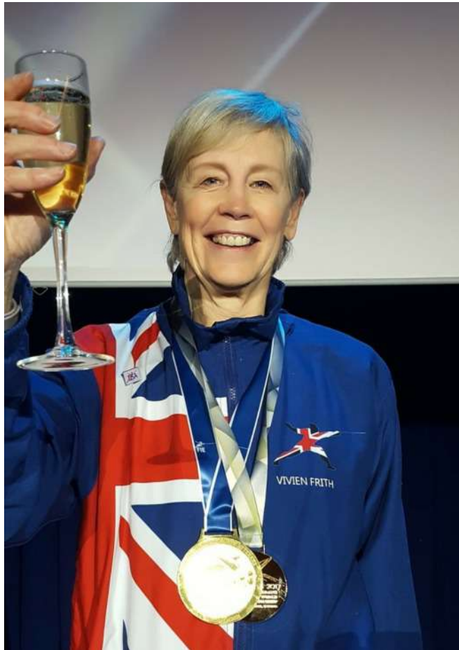
World Champion Vivien Frith, WS Cat C, celebrates in style!