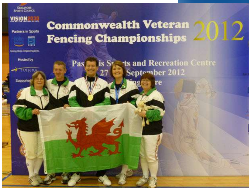
Team Wales Singapore