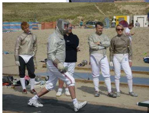
Duel on the Beach